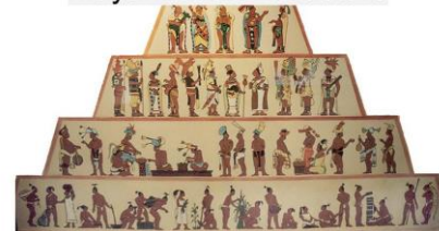
Mayan Social Structure

http://www.theschoolrun.com/homework-help/the-mayans